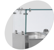
Glass structure for protection of food